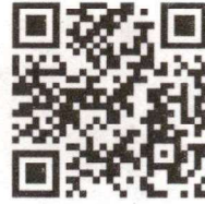
How to String a Yo-Yo

Yo-yos with bearings or a loose axle will spin and won't wind if you just try to wrap the string around the yo-yo freely. Use your thumb to pin down the string against the side of the yo-yo when you begin winding. After a few winds around, you can release your thumb and finish winding the string.