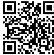
How to Conduct the Pendulum Experiment

Now, gently swing your yo-yo from side to side again, but this time hold the string farther from the yo-yo — and then closer to it.